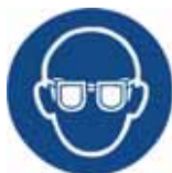
Tightly sealed goggles